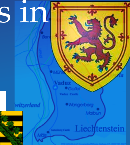
So, that Stuart Coat Arms may now need Liechtensteinian, heraldic additions, if the Stuarts became royal again in Scotland.

James Francis Edward, the "Old Pretender" to the British throne lived from 1688 to 1766. According to those whose loyalties lay with the kings "over the water" he succeeded his father as James VIII & III in 1701. Meanwhile William III continued to reign in Britain proper (Mary having died in 1694) until 1702, when he was succeeded by Mary's sister,