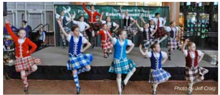
Cincinnati Highland Dancers at Union Terminal Celtic Culture Fest 2011.